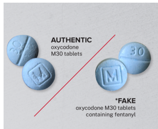
(authentic/fake oxycodone).

Even the person selling or giving you the pills may not know they are fake.